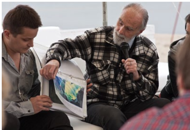
Panel discussion in progress in Sopot. Post-game.

Since the issue of solving eutrophication is so complex and dependent on local politics, we didn't have a ready-made set of solutions that would work from St. Petersburg to Stockholm. In this way, the panel discussions following each larp also fed into the design of the remaining games. We also used the discussions to try to lure experts and politicians to actually play in the larp. Once people signed up for the panel discussion, they became interested in participating in the larp too. Often they decided to play at the last minute, and their participation connected the issues more strongly to the game fiction.